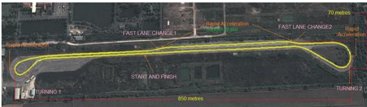
Figure 2 Department of land transport test track

For both lateral and longitudinal acceleration, this consumer grade receiver have proved that it could applied for advance vehicle monitoring system. In tested track, the multiple satellite navigation system ([GPS+Glonass+QZSS] and [GPS+BDS+QZSS]) have no different from dedicated GPS system. However, in real road condition, the multi-GNSS should be advantage